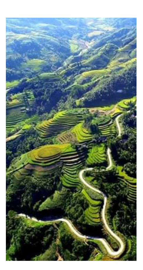
BOOSTING COMMUNITY-BASED TOURISM AND YOUTH WORK FOR GLOBAL SUSTAINABLE DEVELOPMENT